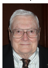
JUDGE SEABORN J. BUCKALEW, JR. 2008 Recipient