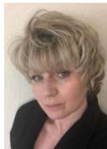
MAGISTRATE JUDGE KIMBERLEY SWEET 2021 Recipient