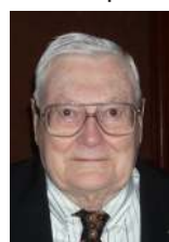
JUDGE SEABORN J. BUCKALEW, JR. 2008 Recipient