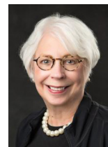
MAYOR PATRICIA B. BRANSON 2022 Recipient