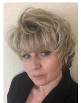
MAGISTRATE JUDGE KIMBERLEY SWEET 2021 Recipient